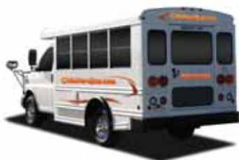
*Bus is shown with optional wheel covers and graphics